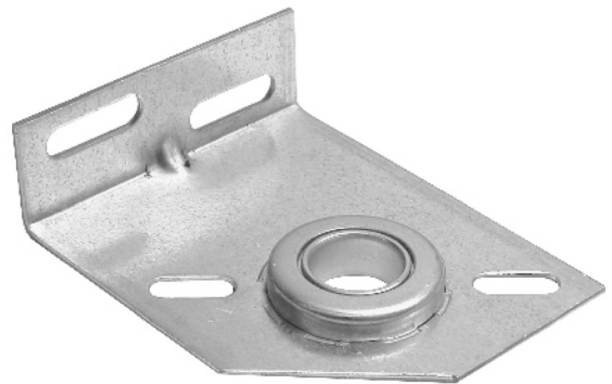
Center Plates available in 3-3/8", 4" and 4-3/4"