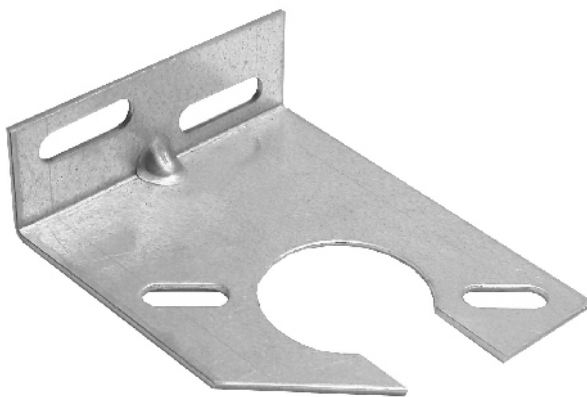
Center Plates, Notched available in 3-3/8", 4" and 4-3/4"