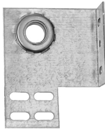
End Bearing Fixtures available in 3-3/8", 4-3/8", 5" and 6"