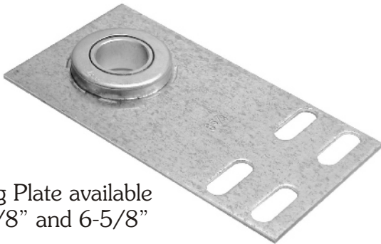
Bearing Plate available in 5-5/8" and 6-5/8"